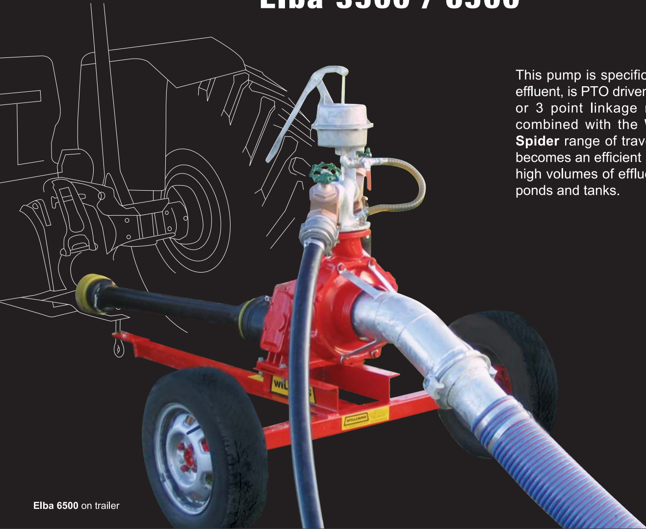
Elba 6500 on trailer

This pump is specifically designed for effluent, is PTO driven and either trailer or 3 point linkage mounted. When combined with the Williams Super Spider range of traveling irrigators, it becomes an efficient unit for spreading high volumes of effluent or water from ponds and tanks.