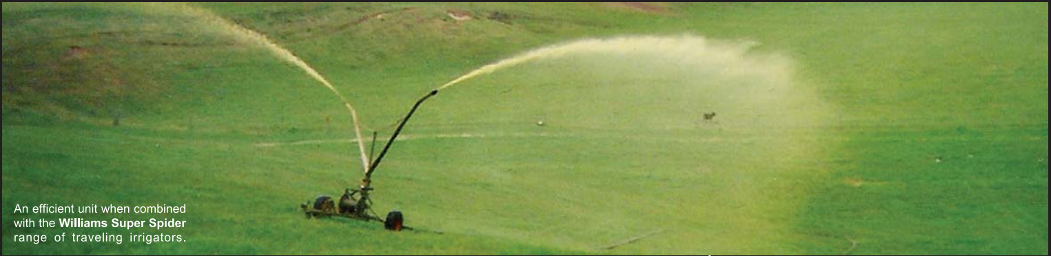
An efficient unit when combined with the Williams Super Spider range of traveling irrigators.